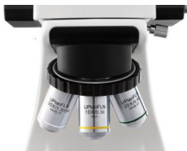
High quality objectives