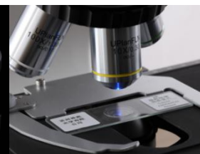
Big slider holder