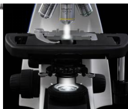
White cold LED light