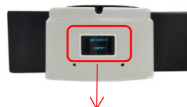
Digital screen show light intensitv 0~100%