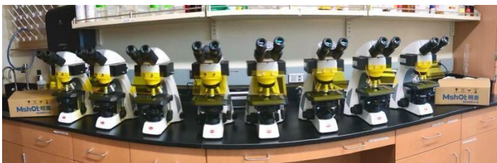
Motic Panthera C