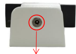
DC power adapter port