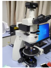
Nikon Ci Pol